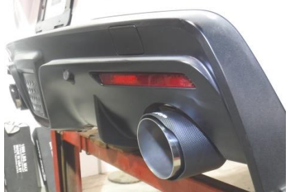
Figure 15 $4300 © 08/22

12. Using a 3.0" Clamp, loosely install the Muffler . It should be angled up about 10 degrees, higher at the rear of the car. Refer to Figure 13.