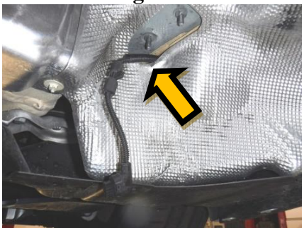
Figure 5 $4300 © 08/22